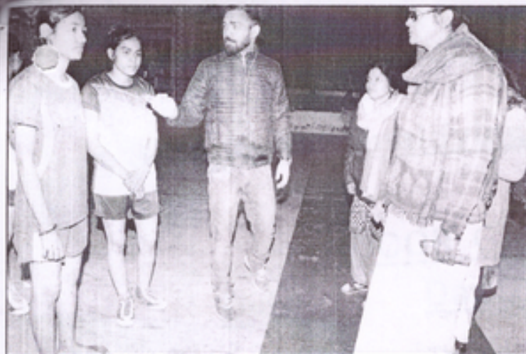
Annual Sports meet Kho -kho Competition (Session 2018-2019) M.G.B.V. PG College Firozabad