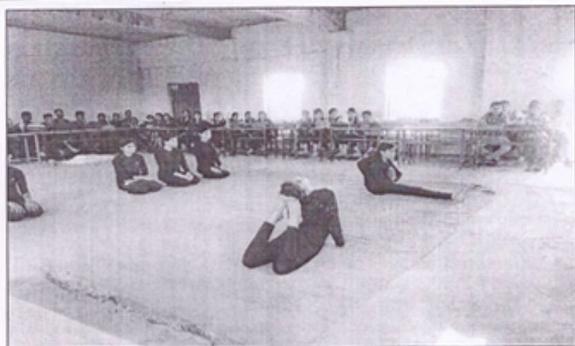
Participation at Inter collegiate Yoga tournament (Session 2018-2019) K.R.T.T. College Mathura