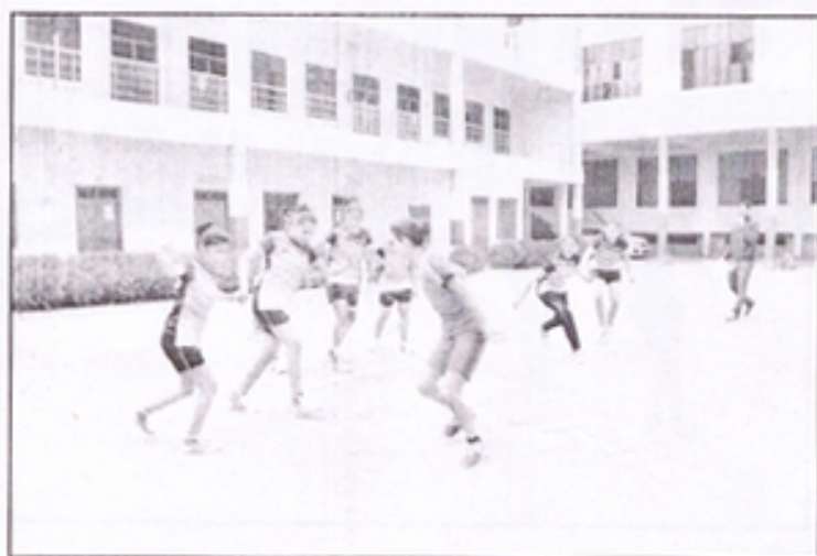
Annual Sports meet Kabbadi Competition (Session 2018-2019) M.G.B.V. PG College Firozabad