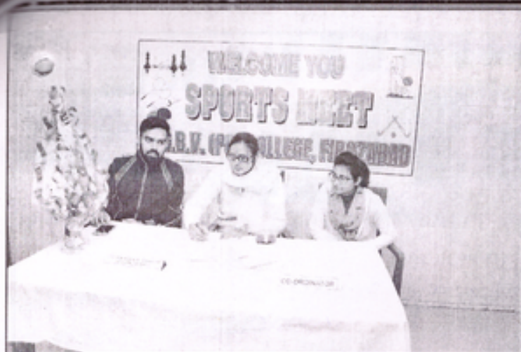
Annual Sports meet (Session 2018-2019) M.G.B.V. PG College Firozabad