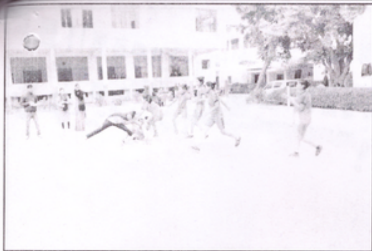
Annual Sports meet Kabbadi Competition (Session 2018-2019) M.G.B.V. PG College Firozabad