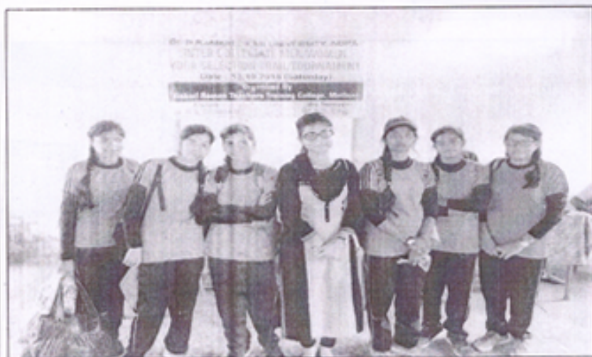
Participation at Inter collegiate Yoga tournament (Session 2018-2019) K.R.T.T. College Mathura