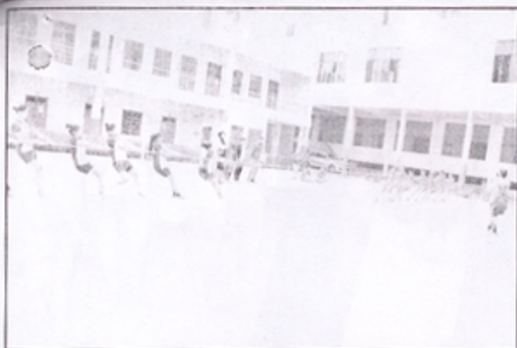
Annual Sports meet Tug of war Competition (Session 2018-2019) M.G.B.V. PG College Firozabad