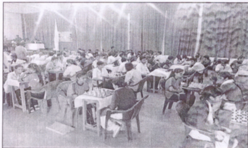
Participation at Inter collegiate Chess tournament (Session 2018-2019) S.V. College Aligarh