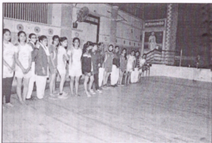
Annual Sports meet Lemon Spoon Competition (Session 2018-2019) M.G.B.V. PG College Firozabad