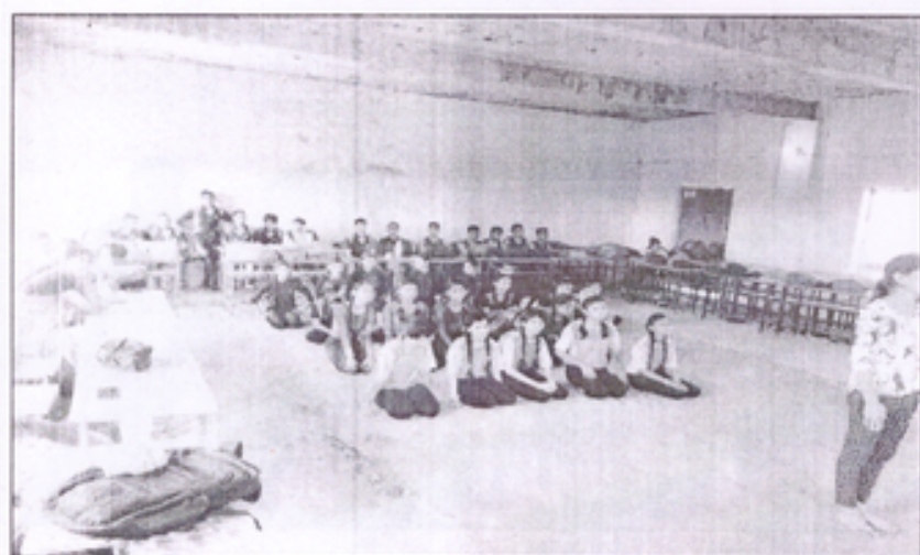
Participation at Inter collegiate Yoga tournament (Session 2018-2019) K.R.T.T. College Mathura