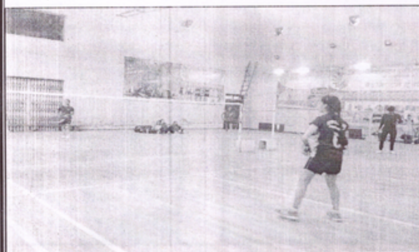
Participation at Inter collegiate Badminton tournament (Session 2018-2019) Chitrgupt (PG) College Mainpuri