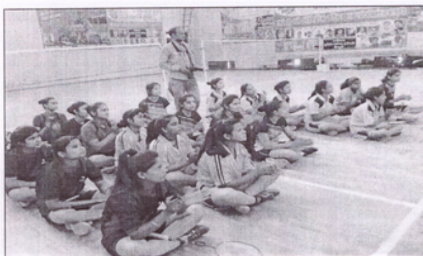
Participation at Inter collegiate Badminton tournament (Session 2018-2019) Chitrgupt (PG) College Mainpuri