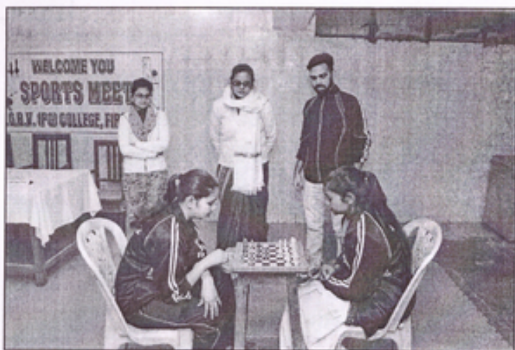
Annual Sports meet Chess Competition (Session 2018-2019) M.G.B.V. PG College Firozabad