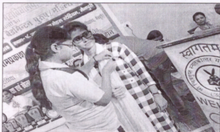
Participation at Inter collegiate Badminton tournament (Session 2018-2019) Chitrgupt (PG) College Mainpuri