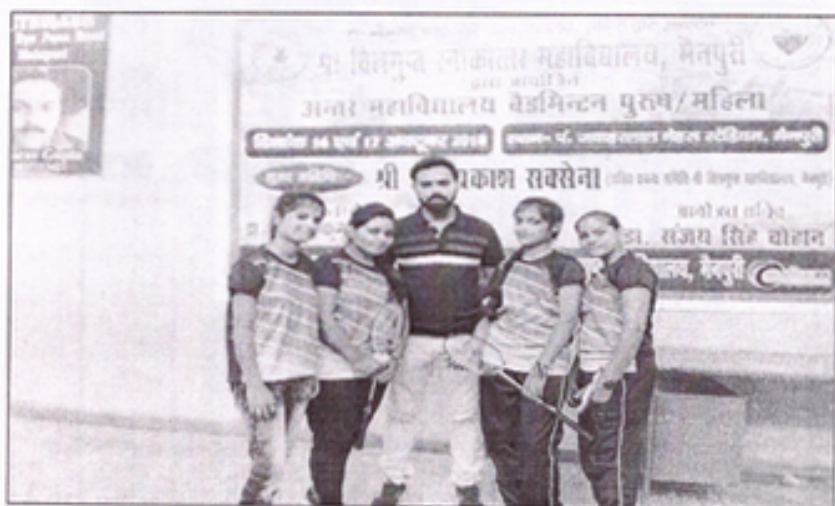
Participation at Inter collegiate Badminton tournament (Session 2018-2019) Chitrgupt (PG) College Mainpuri