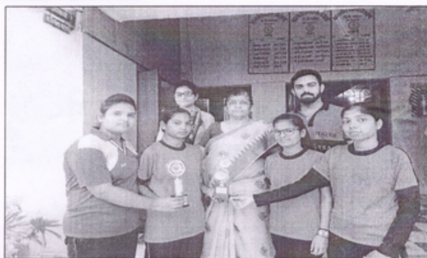
Got 3 rd place in Inter collegiate Chess tournament (Session 2018-2019) S.V. College Aligarh