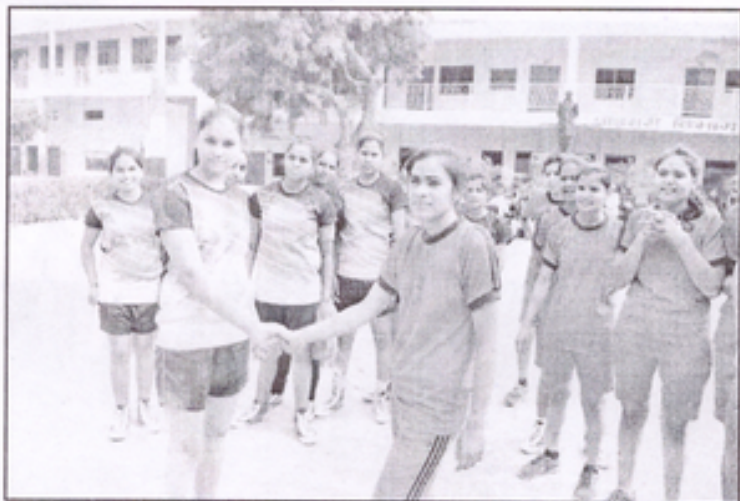
Annual Sports meet Kabbadi Competition (Session 2018-2019) M.G.B.V. PG College Firozabad