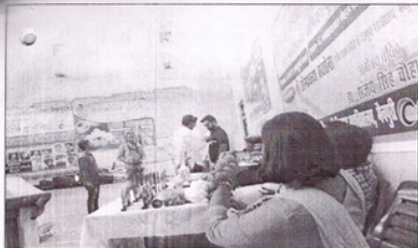
Participation at Inter collegiate Badminton tournament (Session 2018-2019) Chitrgupt (PG) College Mainpuri