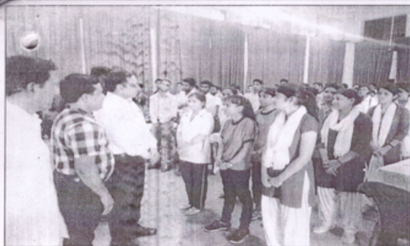
Participation at Inter collegiate Chess tournament (Session 2018-2019) S.V. College Aligarh