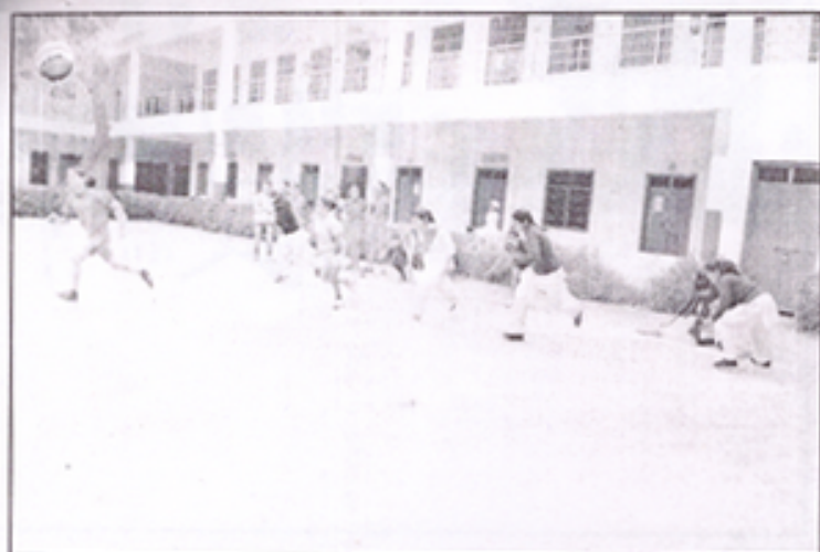
Annual Sports meet 100 mt Shuttle Running (Session 2018-2019) M.G.B.V. PG College Firozabad