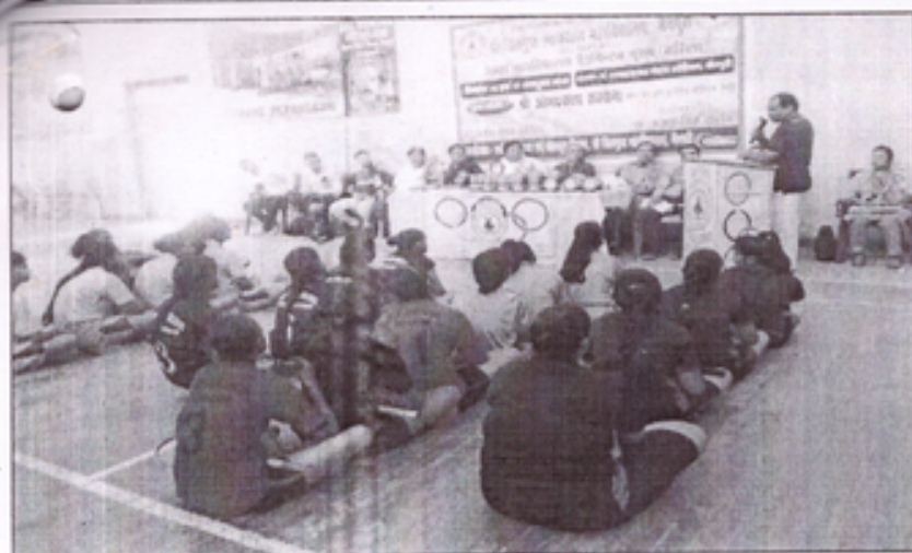
Participation at Inter collegiate Badminton tournament (Session 2018-2019) Chitrgupt (PG) College Mainpuri