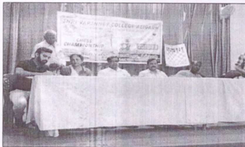
Participation at Inter collegiate Chess tournament (Session 2018-2019) S.V. College Aligarh