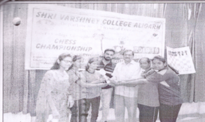
Got 3 rd place in Inter collegiate Chess tournament (Session 2018-2019) S.V. College Aligarh