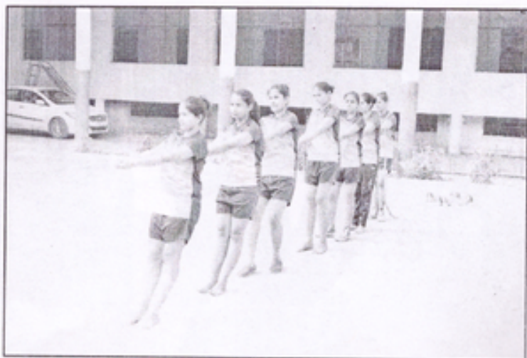
Annual Sports meet Tug of war Competition (Session 2018-2019) M.G.B.V. PG College Firozabad