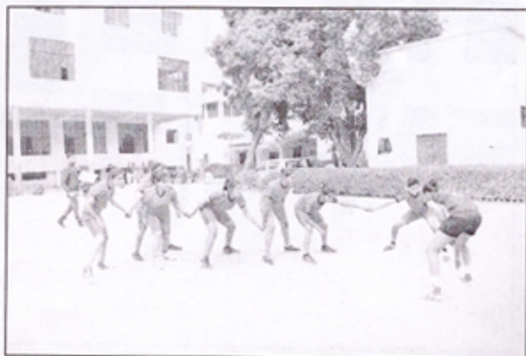
Annual Sports meet Kabbadi Competition (Session 2018-2019) M.G.B.V. PG College Firozabad