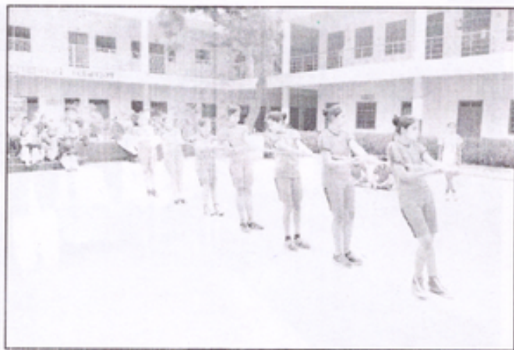
Annual Sports meet Tug of war Competition (Session 2018-2019) M.G.B.V. PG College Firozabad