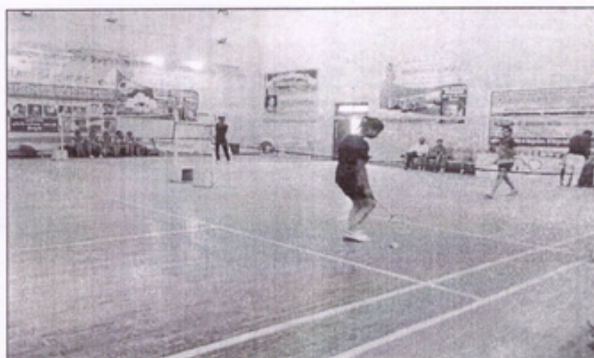
Participation at Inter collegiate Badminton tournament (Session 2018-2019) Chitrgupt (PG) College Mainpuri