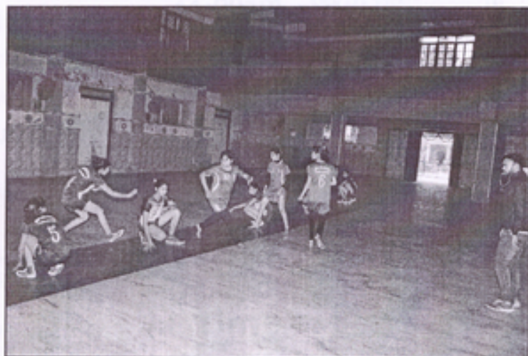
Annual Sports meet Kho -kho Competition (Session 2018-2019) M.G.B.V. PG College Firozabad