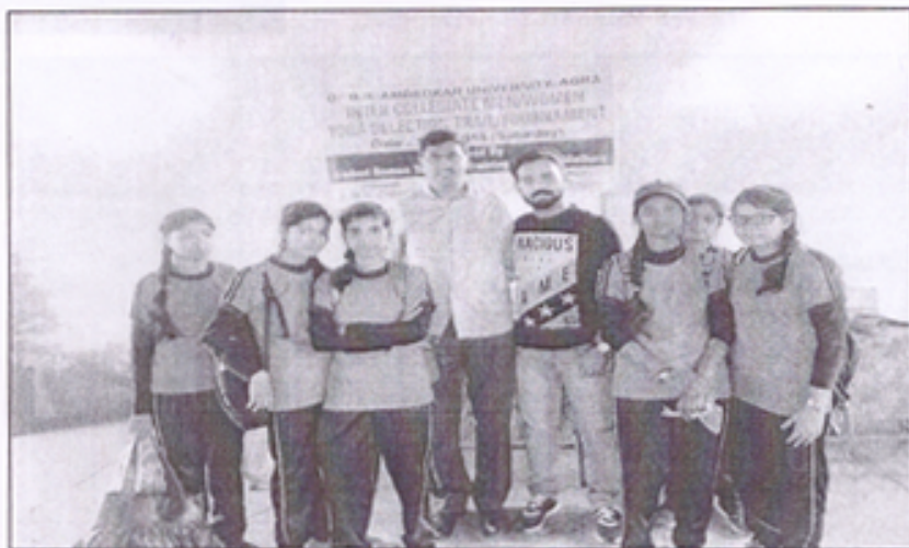
Participation at Inter collegiate Yoga tournament (Session 2018-2019) K.R.T.T. College Mathura