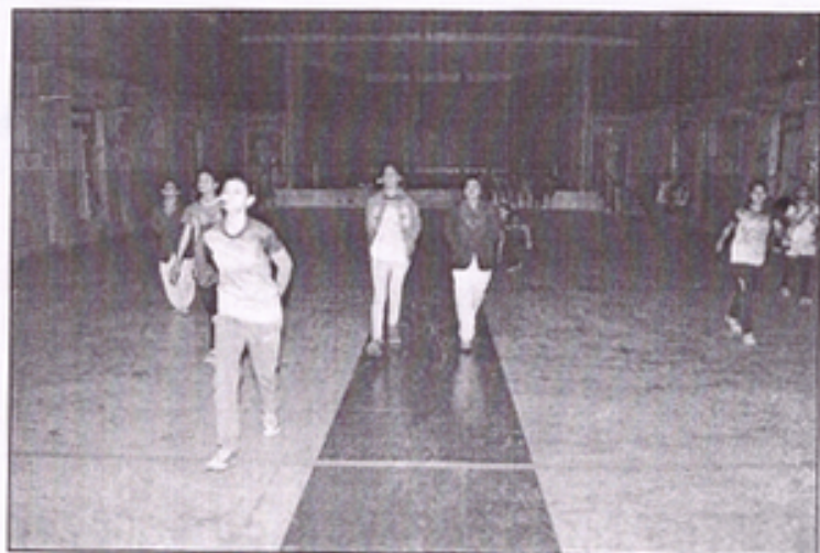
Annual Sports meet Lemon Spoon Competition (Session 2018-2019) M.G.B.V. PG College Firozabad