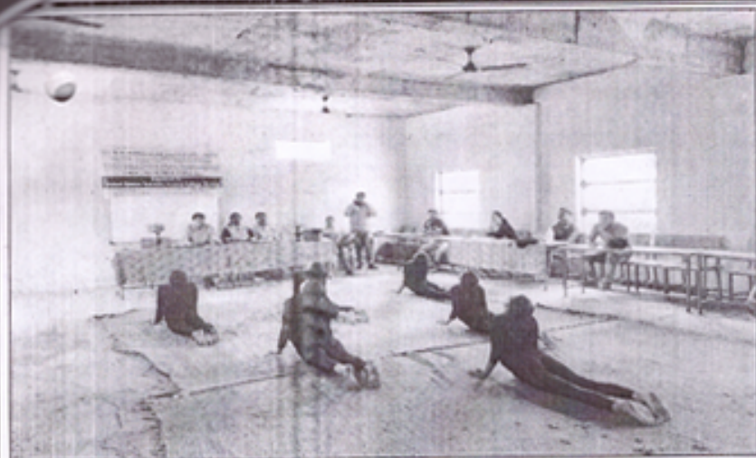
Participation at Inter collegiate Yoga tournament (Session 2018-2019) K.R.T.T. College Mathura