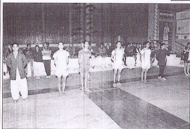
Annual Sports meet Lemon Spoon Competition (Session 2018-2019) M.G.B.V. PG College Firozabad