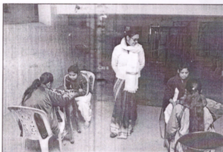
Annual Sports meet Chess Competition (Session 2018-2019) M.G.B.V. PG College Firozabad