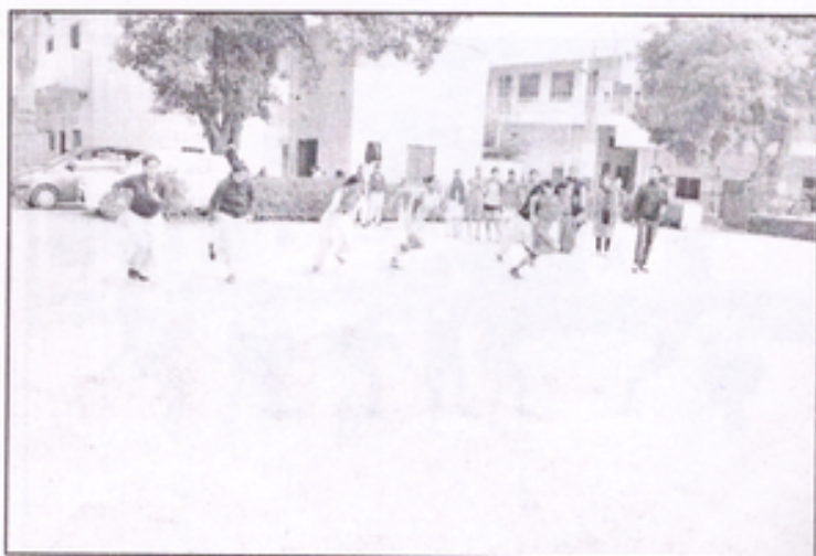
Annual Sports meet 100 mt Shuttle Running (Session 2018-2019) M.G.B.V. PG College Firozabad