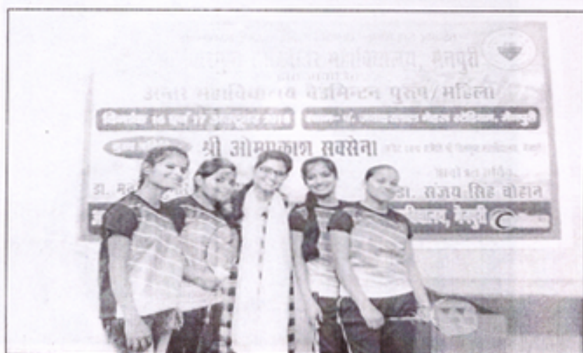
Participation at Inter collegiate Badminton tournament (Session 2018-2019) Chitrgupt (PG) College Mainpuri