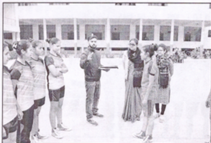
Annual Sports meet Kabbadi Competition (Session 2018-2019) M.G.B.V. PG College Firozabad