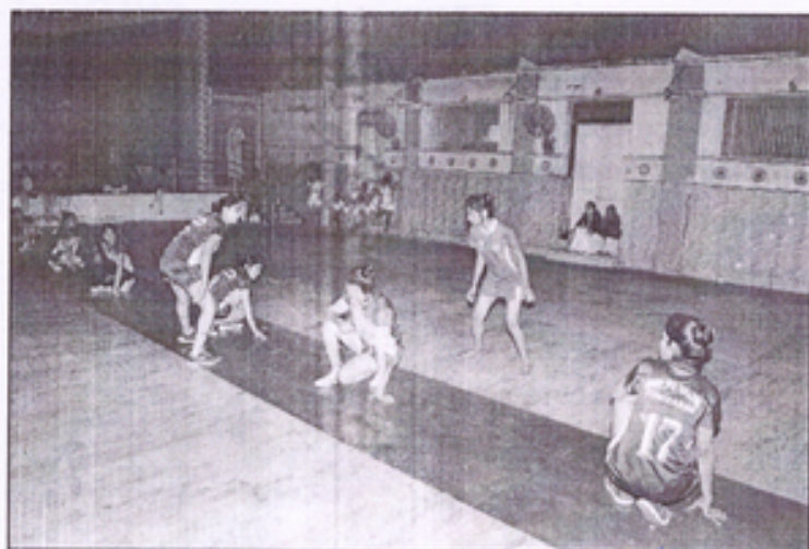
Annual Sports meet Kho -kho Competition (Session 2018-2019) M.G.B.V. PG College Firozabad