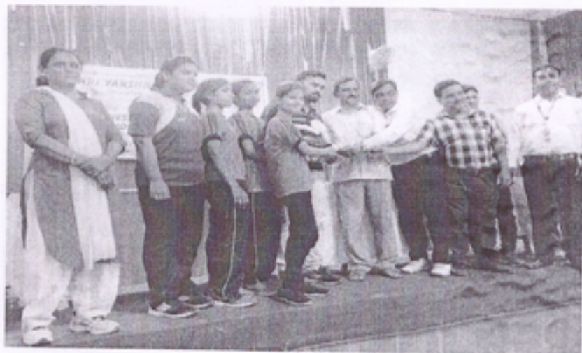
Got 3 rd place in Inter collegiate Chess tournament (Session 2018-2019) S.V. College Aligarh